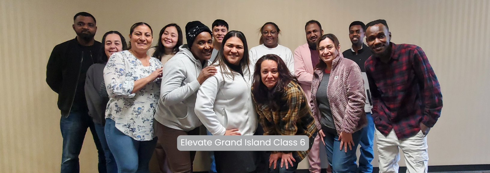
Elevate Grand Island Class 6