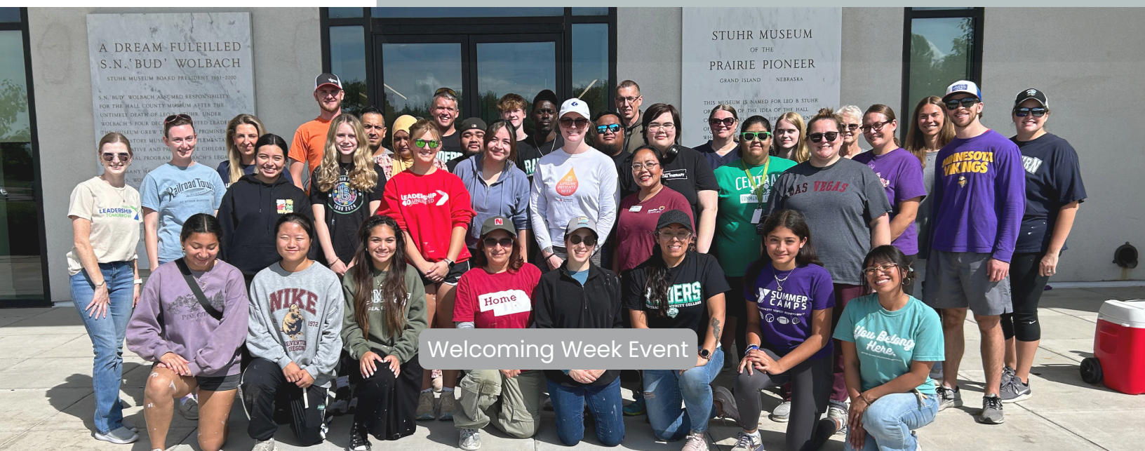
Welcoming Week Event