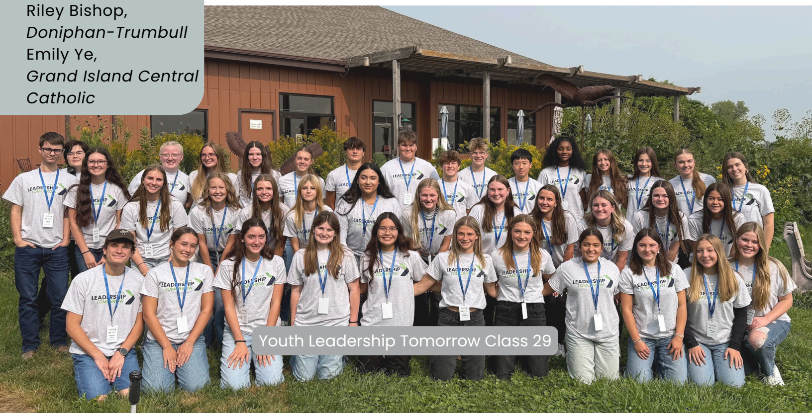
Youth Leadership Tomorrow Class 29