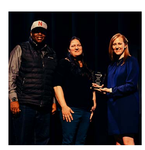
New Business Partner of the Year