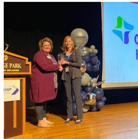
Outstanding Program Support Partner of the Year