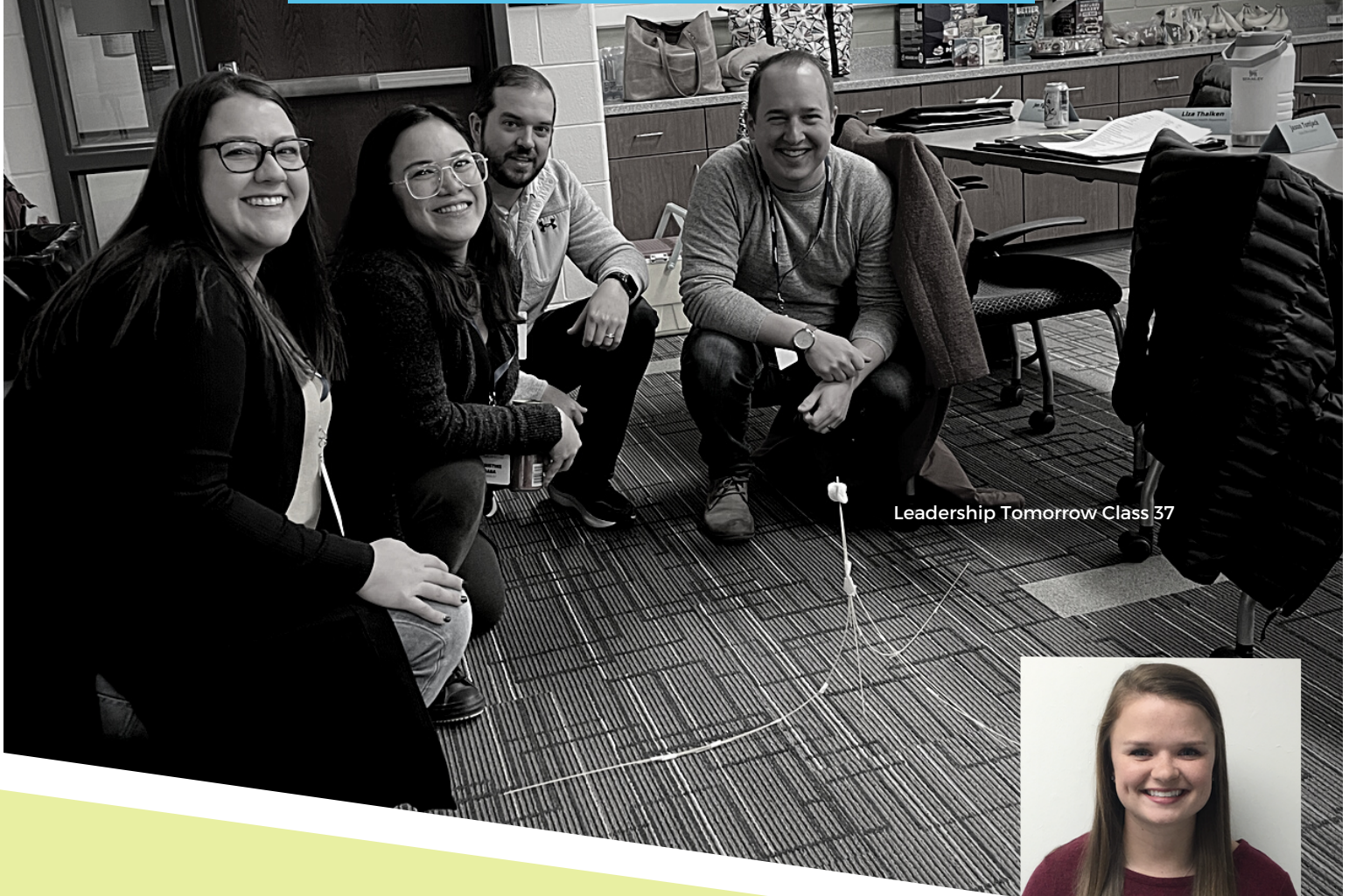
Leadership Tomorrow Class 37