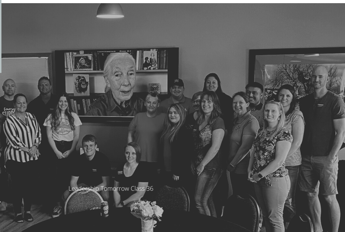
Leadership Tomorrow Class 36