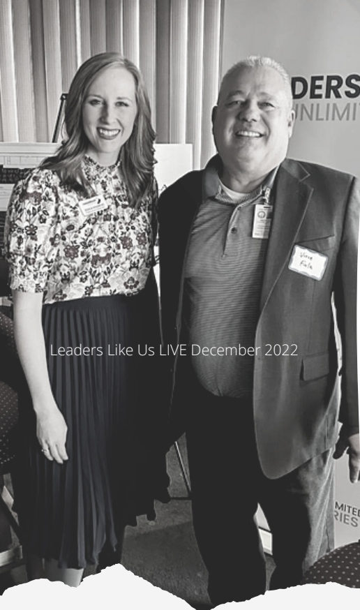
Leaders Like Us LIVE December 2022

2022 has been a year of advancement for our organization, marked clearly by our rebranding and decision to step forward using our legal name, Leadership Unlimited. Although we have always officially been Hall County Leadership Unlimited, Inc., our community has known us by the name of our flagship program, Leadership Tomorrow (LT). We're proud to have LT continue as our flagship, and we have stepped up to the challenge of meeting the evolving needs of our community with four additional programs - Youth Leadership Tomorrow, Discover Grand Island, Elevate Grand Island, and the Executive Series. Our branding now encompasses all the ways we are meeting our mission: to educate individuals committed to developing leadership skills to improve our community.